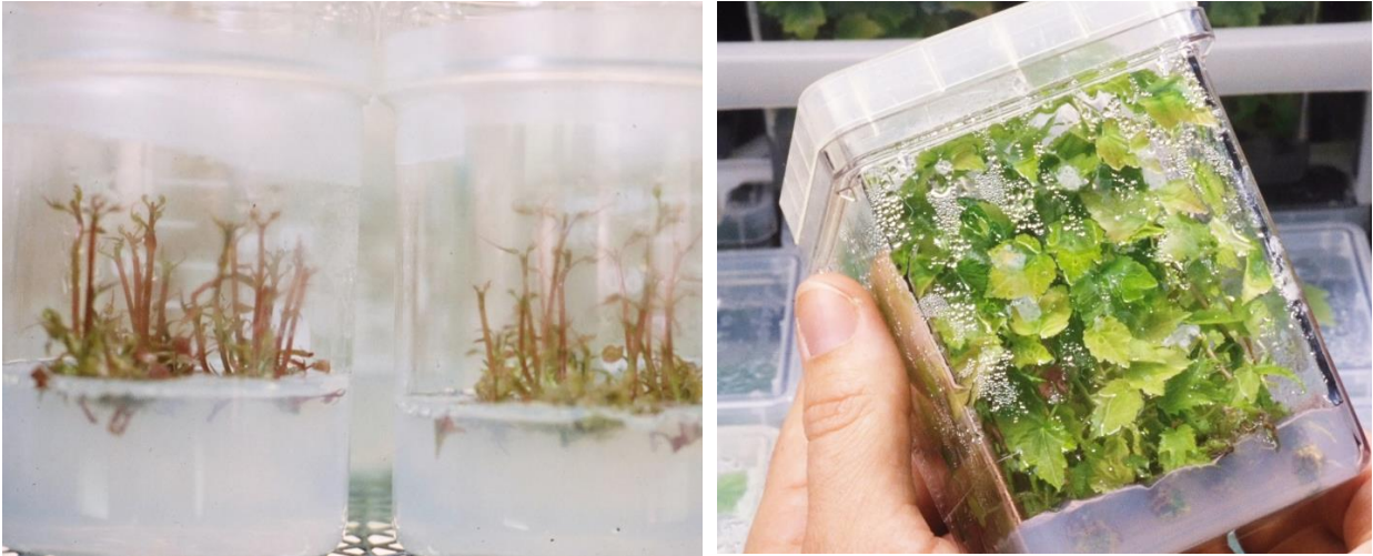
Figure 3. Acer on basic formula (left) and Acer after computer aided salts optimization (right).

Inorganic salts play the most important role in media optimization for difficult to grow plants (Fig. 3).