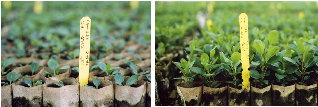
Figure 2. Pear rootstock OH×F-333 planted at the same time during cool/short days. Left image is without and right is with vernalization period.

We have found that we can store certain plants for many months at 2–4 °C. This smooths out production peaks and saves labor during maintenance of crops. Also, Malus and Pyrus actually benefit from a cold treatment of 2–4 °C for at least 1,000 h prior to acclimatization, especially when the greenhouse step is done under cold short-day conditions (Fig. 2).