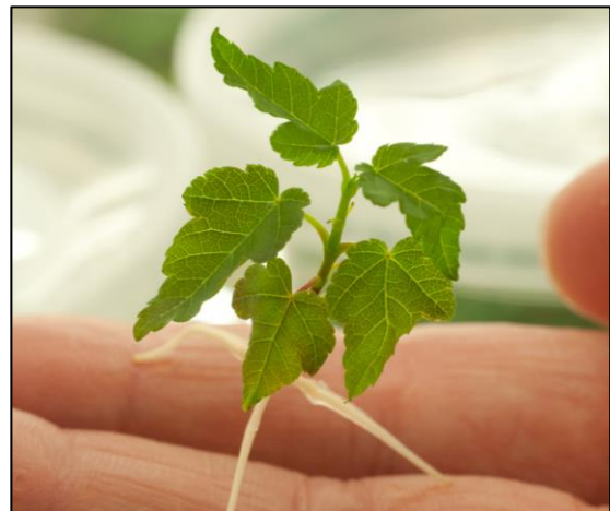
Figure 1. Rooted microcutting of maple.

A partnership between Pete McGill, Treco®, Stark Brothers® and Adams Rootstock was formed and Microplant Nurseries, Inc. was launched in 1980 with that goal in mind.